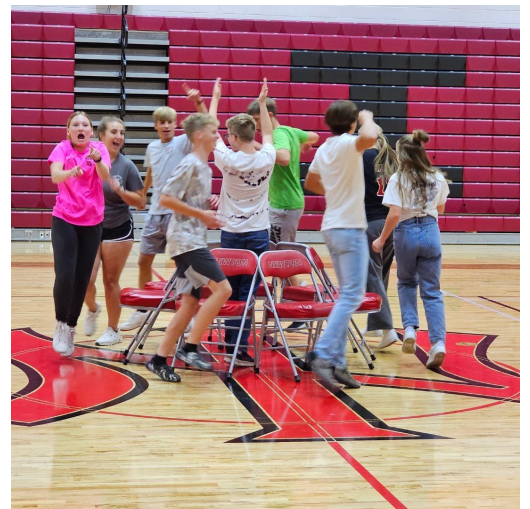
Musical Chairs at the FFA meeting