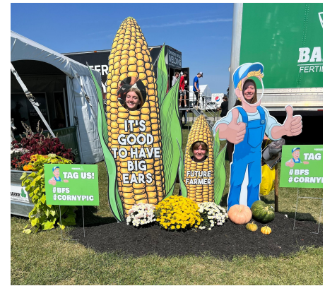
Farm Science Review