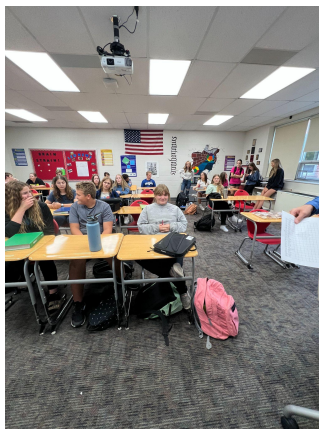
First Leo Club Meeting of the School Year.