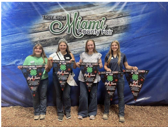
Miami County Fair Livestock Judging