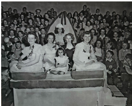
The first ever Newton Homecoming 1947