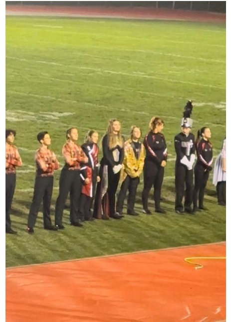
Marching Band at Troy Competition