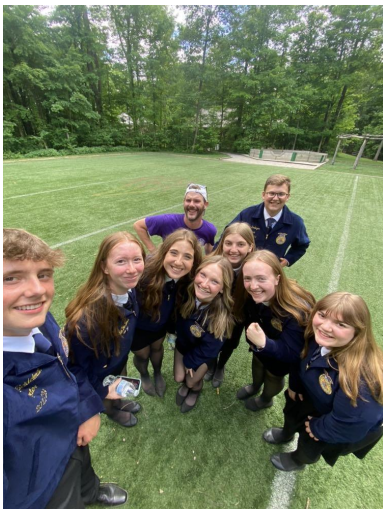
2023 FFA Officer Retreat