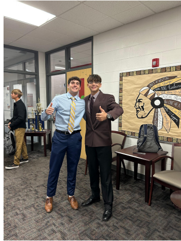
Senior Homecoming Court Photos