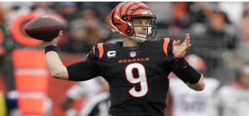
Bengals Quarterback Joe Burrow