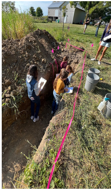
County Soil Judging